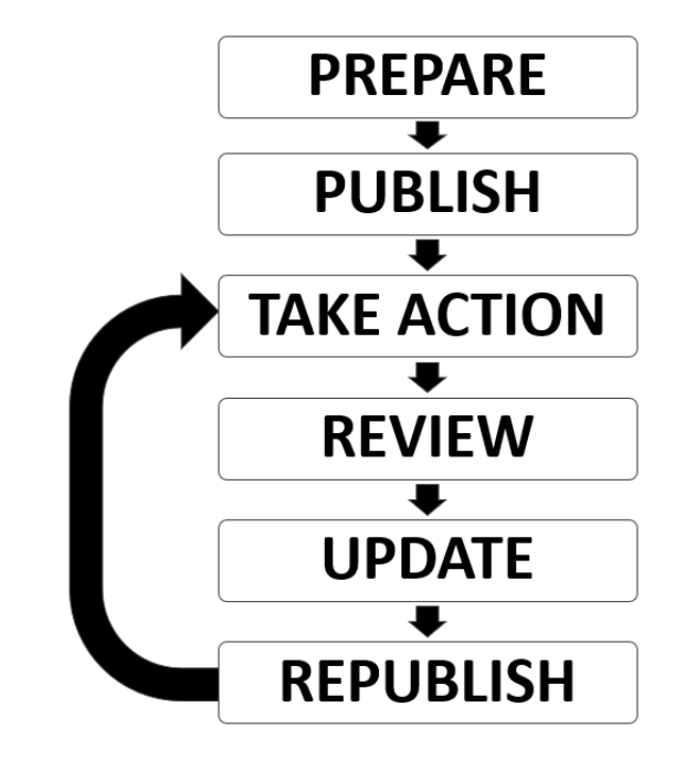
Figure 1: Local nature recovery strategy review and republication cycle